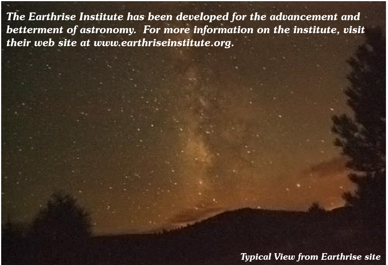
Typical View from Earthrise site

The Earthrise Institute has been developed for the advancement and betterment of astronomy. For more information on the institute, visit their web site at www.earthriseinstitute.org .